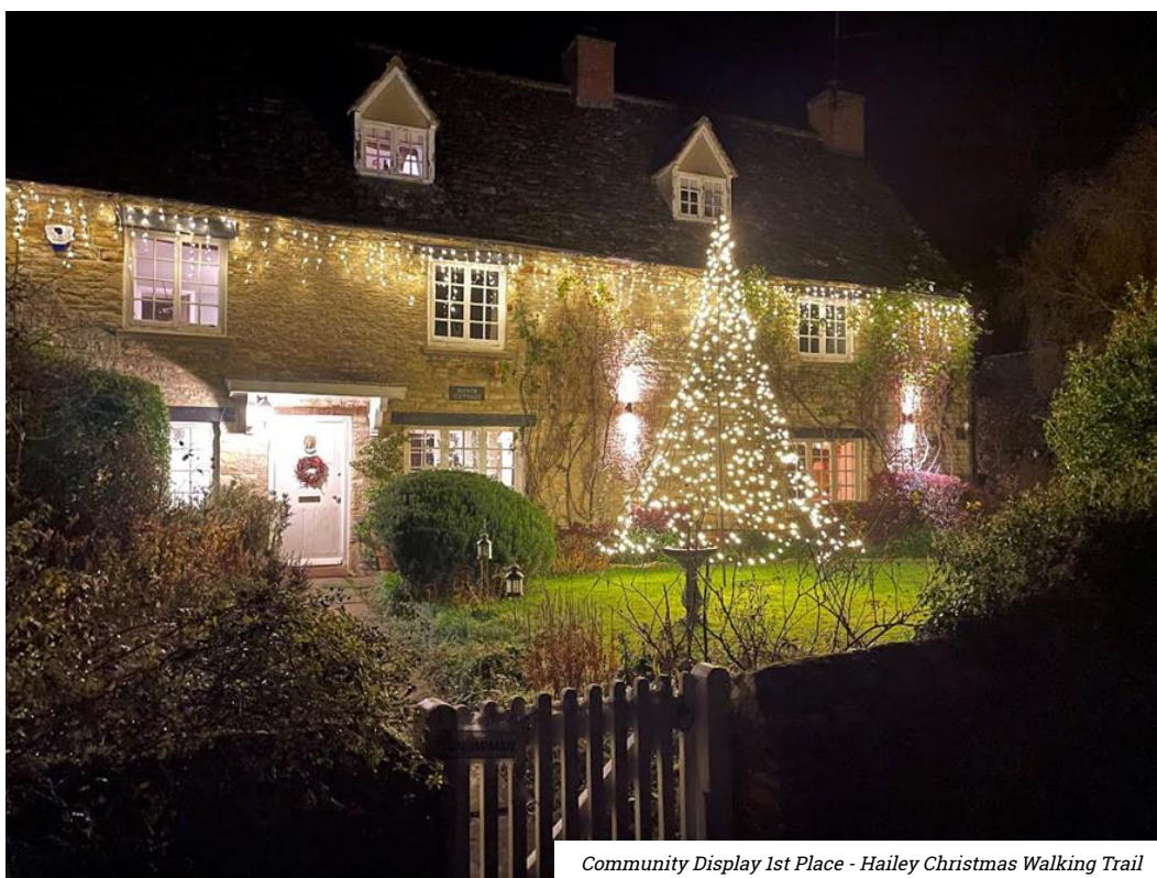
Community Display 1st Place - Hailey Christmas Walking Trail

British Garden Centres has taken exclusive sponsorship of the national Christmas campaign, Illumination Street for a second year.