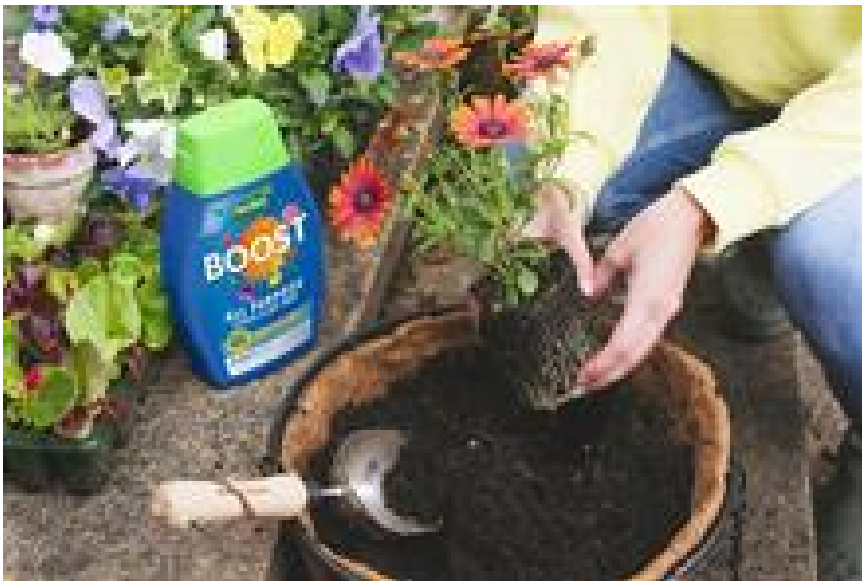
Garden centre stock building - how is the supply chain looking for 2022?