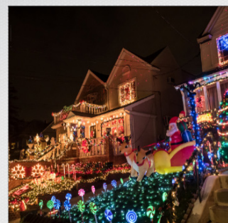
Best Community Outdoor Display