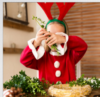
Best Children's Display