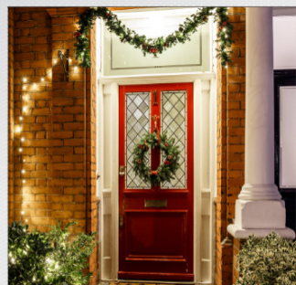
Best Front Door Wreath Display