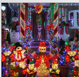
Best Large Outdoor Display

Illumination Street is a competition highlighting and rewarding the passion, flair and effort invested in front gardens around Britain during the build up to Christmas. Sponsored by British Garden Centres group and supported by The Sunday Mirror, the competition inspires both adults and children to create imaginative front garden and home displays during the festive holidays.