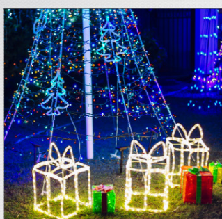
Best Small Outdoor Display