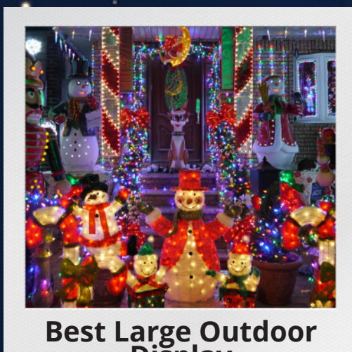
Best Large Outdoor Display

Illumination Street is a competition highlighting and rewarding the passion, flair and effort invested in front gardens around Britain during the build up to Christmas. Sponsored by British Garden Centres group and supported by The Sunday Mirror, the competition inspires both adults and children to create imaginative front garden and home displays during the festive holidays.