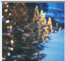
Best Community Christmas Display