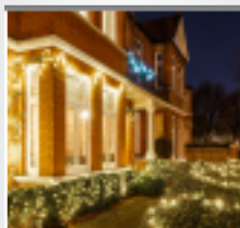
Best Front Garden Large Outdoor Display

Illumination Street is a competition founded by Chartered Horticulturist and broadcaster, David Domoney, highlighting the passion, flair and effort invested into front gardens around Britain in the build up to Christmas. Sponsored by Safestyle, the competition inspires both adults and children to create imaginative front garden and home displays during the festive holidays.