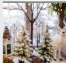
Best Children's Window Display