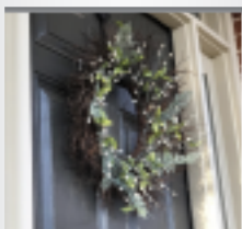
Best Front Door Christmas Display