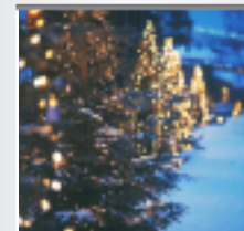
Best Community Christmas Display