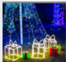
Best Front Garden Small Outdoor Display