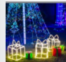
Best Front Garden Small Outdoor Display