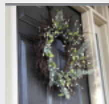
Best Front Door Christmas Display