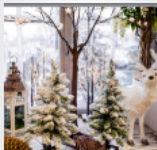
Best Children's Window Display