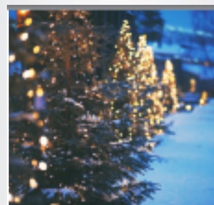
Best Community Christmas Display