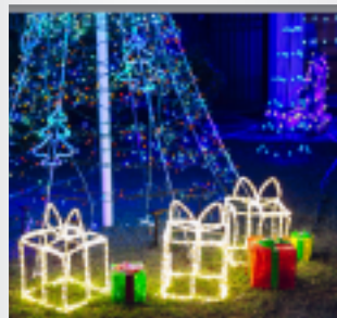
Best Front Garden Small Outdoor Display