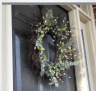
Best Front Door Christmas Display