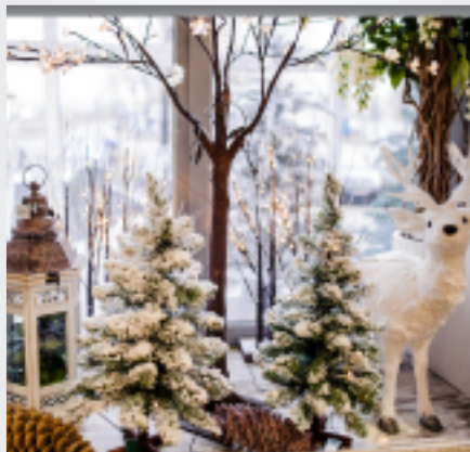
Best Children's Window Display