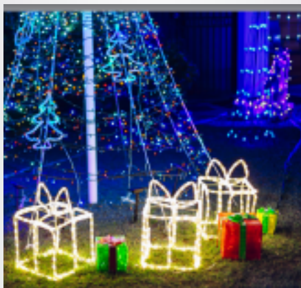
Best Front Garden Small Outdoor Display