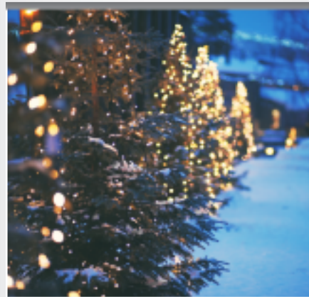
Best Community Christmas Display